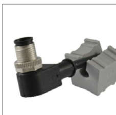
Slit KT grommets