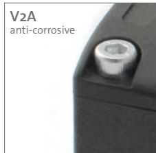
V2A anti-corrosive Also available with stainless steel screws (V2A).